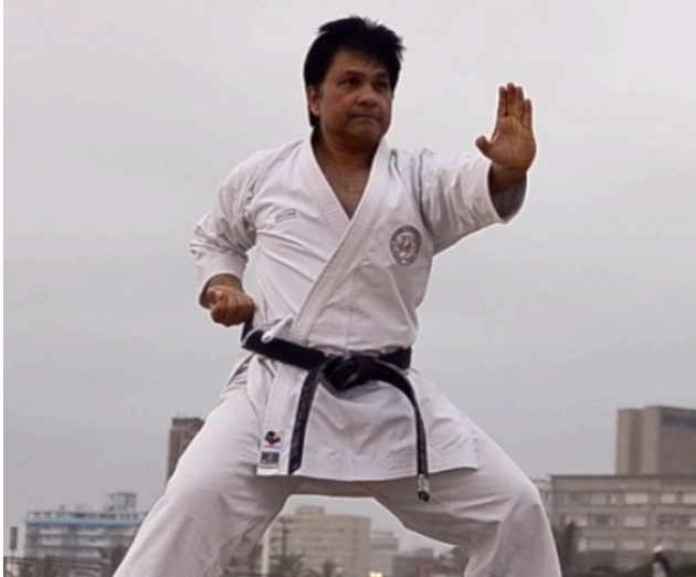
From the Chief Instructor

A warm karate welcome to you! Thank you for choosing to study with our organization. I trust that you enjoyed a restful summer holiday and are all keeping safe and healthy during this very serious pandemic.